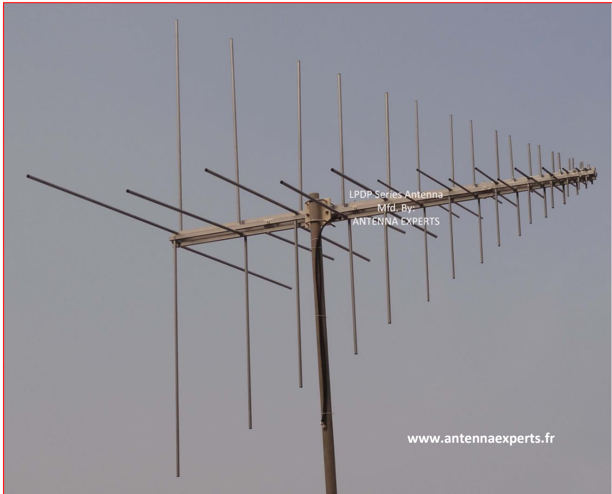
LPDP 30-1000 MHz. Avec mâtereau en fibre de verre.